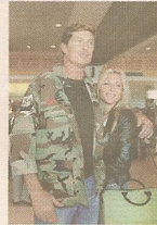
Hasselhoff and wife arriving in Sydney.

On Thursday, the actor and singer, 53, spent several hours at Nova studios in Sydney, first taping a chat with Merrick and Rosso and later using the boardroom for more interviews. Hoff's minders